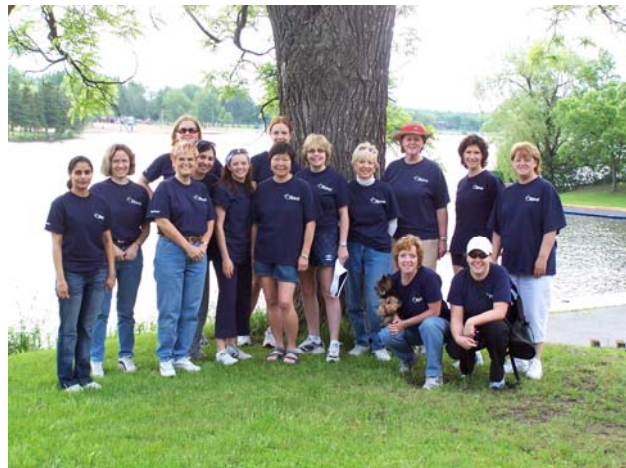
Pictured above are members of the City of Ottawa Team Revenue, participants in the Annual Manulife Walk & Fun Run event in support of Breast Cancer Action.

At Breast Cancer Action, every donor dollar counts . The friendships we forge serve to help strengthen our role as a service provider for those diagnosed with breast cancer in our community.